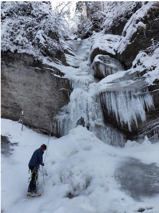
Übungsfall, 30m, WI 2

The top can be reached through the forest on the right.